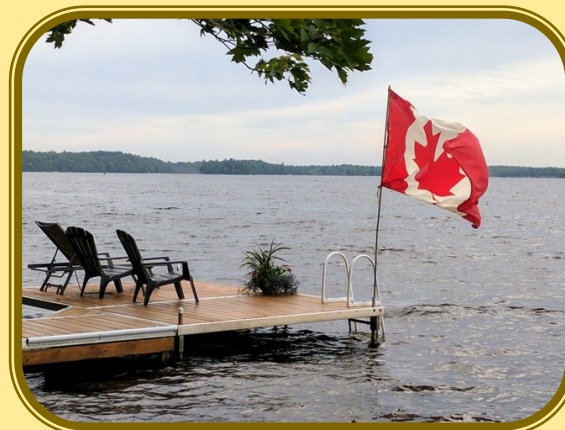
2017 Photo contest: Celebrate Canada 150 Canada Strong - Karen Taylor