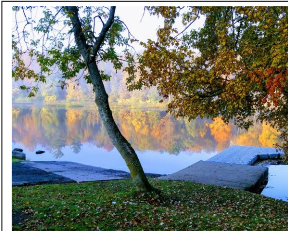
2018 Photo contest: Beauty Maggie's Landing Marmora Debra Quesnelle

Or leave your envelope in the CLWA box at 31 Forsyth Street, Marmora