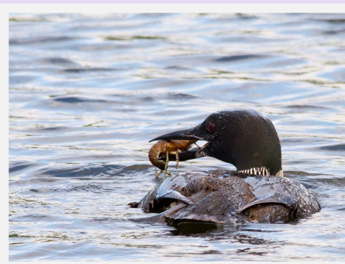
2016 Photo contest: Wildlife