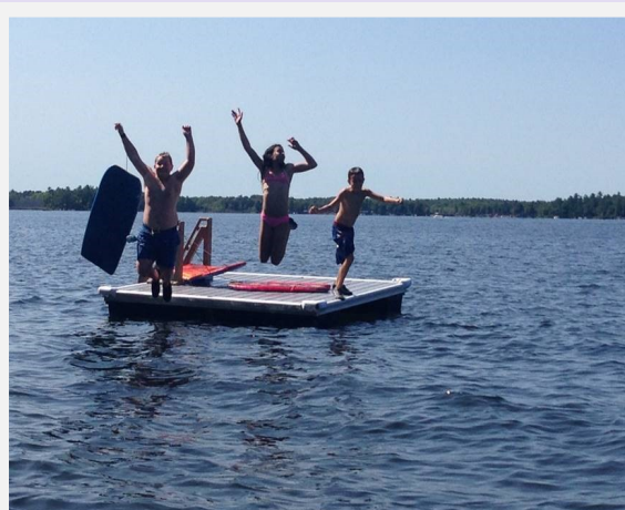
2016 Photo contest: Recreation

Please invite your friends and neighbours to join CLWA!